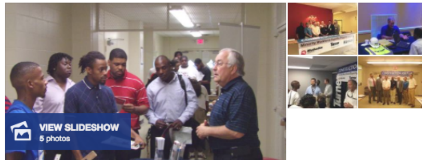
A subcontractor speaks to a group of job seekers at a previously held job fair as part of... more